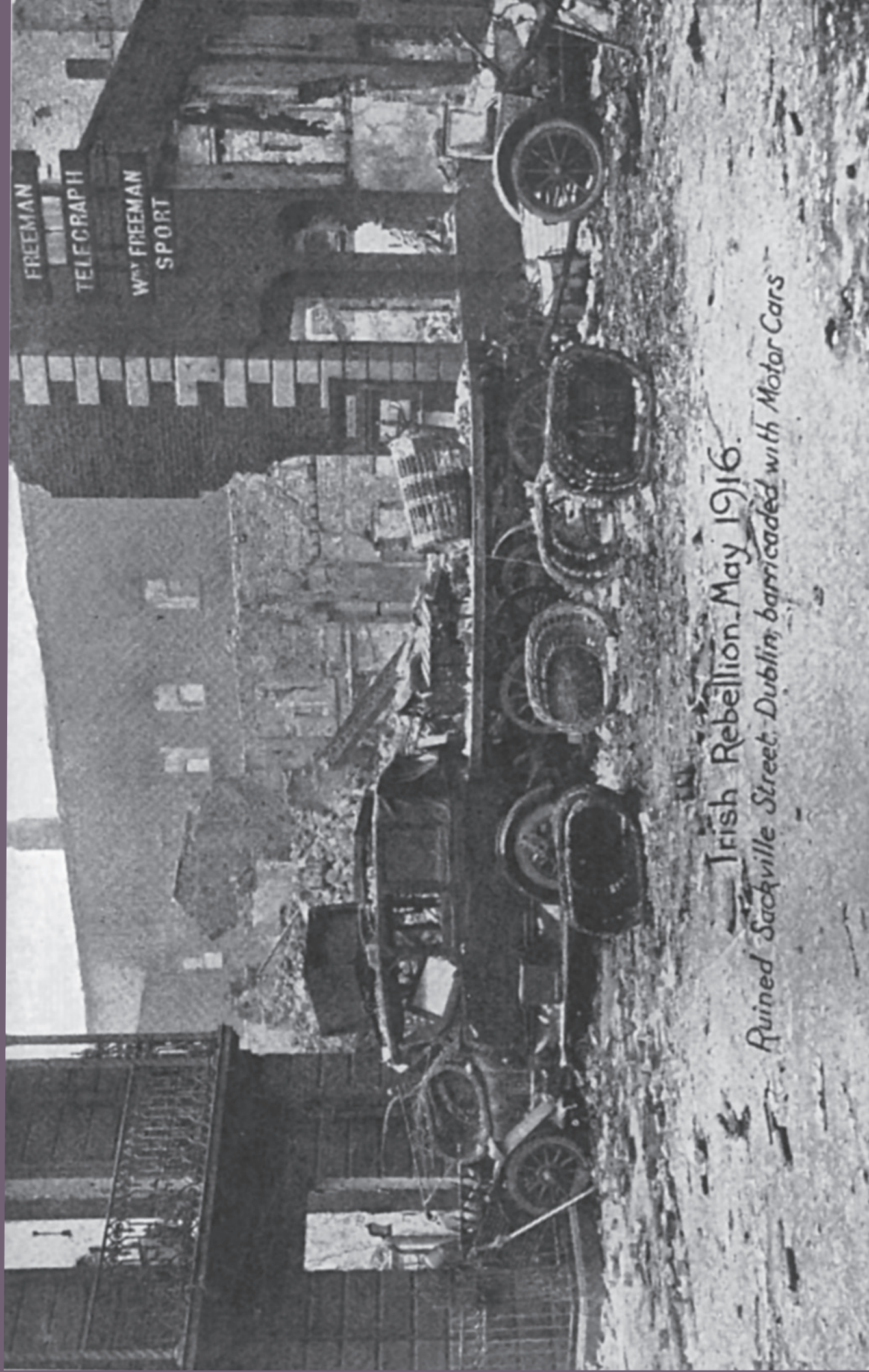
Irish Rebellion, May 1916. Ruined Sackville Street, Dublin, barricaded with Motor Cars